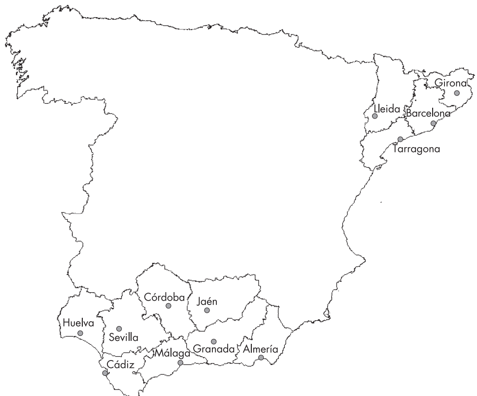
Figure 1 Capital cities of the provinces in Andalusia (southern Spain) and Catalonia (northeast Spain).

A small-area ecological study was devised using the census section as the unit for analysis. The study was carried out in the provincial capital cities of Andalusia (Almeria, Cadiz, Cordoba, Granada, Huelva, Jaen, Malaga and Seville) and the provincial capital cities of Catalonia (Barcelona, Girona, Lleida and Tarragona; fig 1). A total of 3572 census sections were examined, 1556 in Andalusia and 2016 in Catalonia (table 1).